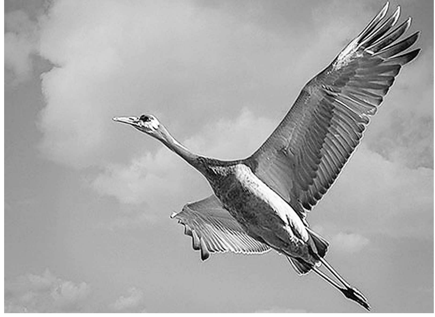
This sandhill crane photograph by Jane Pittenger won the "Wildlife Viewing" category in the ODFW contest.