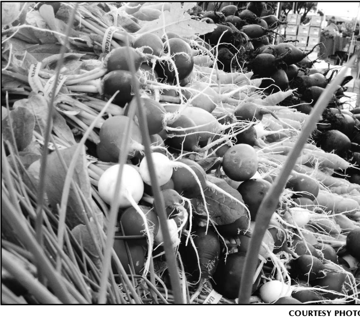
Fresh vegetables are incorporated into OSU's Nutrition Education Program in conjunction with Food Share.

pensive meal samples, volunteers are also trained to educate pantry clients about: nutrition, budget-stretching tips, and leading healthy and active lives.