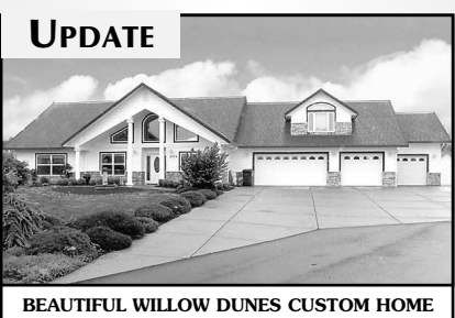
peauty has all the amenities to enjoy peaceful, relaxing golf course living in the middle of town. Exquisite design & decor, custom rock corner fireplaces, covered outdoor living area & a kitchen like no other! Call for appt to see this amazing home with 4 car garage. $650,000 #11050 MLS#15161817