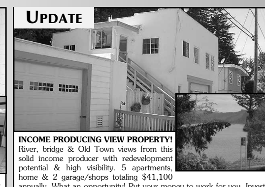
home & 2 garage/shops totaling $41,100 annually. What an opportunity! Put your money to work for you. Invest in the future of Florence with this coveted location by the bridge & river. $395,000 #11063 MLS#15249697