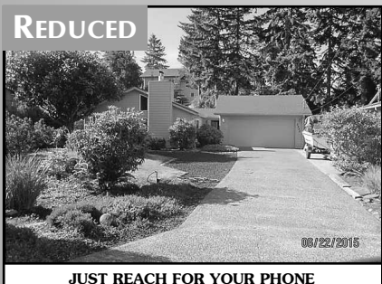
JUST REACH FOR YOUR PHONE and let's discuss this nice home near the end of a dead end street! Additional features includes family room and garage with extra oven/range combo and sink for pro- $214.900 #11061