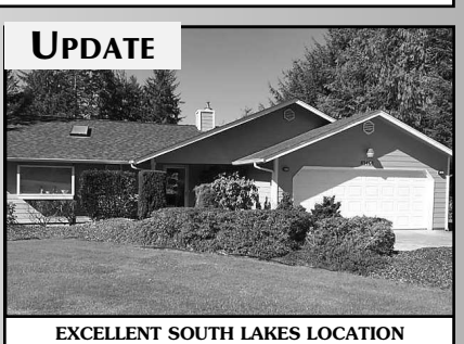
Well cared for 2294 sq. ft. home with many recent upgrades including hardiplank siding (2014), roof (2 years ago), bamboo flooring and ductless heat pump. Spacious rooms and meticulous grounds complete the package. 2 outbuildings. Value added & priced to sell! $265,000 #10946 MLS#14491905