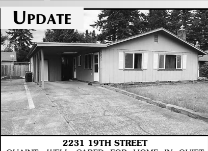
2231 19TH STREET WELL CARED FOR HOME IN QUIET NEIGHBORHOOD. Wind protected city location with fenced backyard and tons of parking. Super clean 2 bedroom, 1 bath home. Move-in ready. Nice laminate flooring in master bedroom with slider to vard. Perfect starter home or retirement home. $158,000 #11051 MLS#15223023