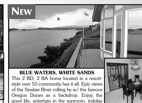
your hobbies in 1 of 2 workshops, fish from your steps or watch sunsets from the deck or great room. RV carpor w/hook-ups; newer decking & roof w/in last 2 years make for carefree living. $229,000 #11075 MLS#15051345