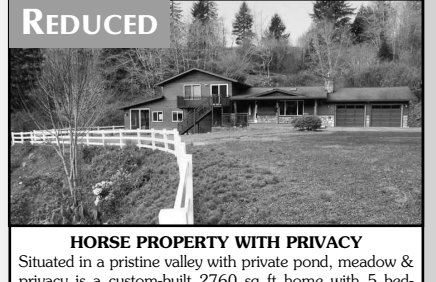
privacy is a custom-built 2760 sq ft home with 5 bed stables & paddock. Chicken coop too. Inside house, privacy also abounds with even a corner for a dark room. Just doesn't get much better for horses & people in this micro-climate location. RR5 zoning. $549,000 #10888 MLS#15690083