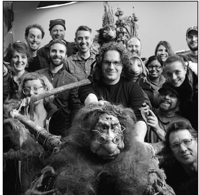
Stripey Pajamas Productions puppeteers with their creations for the short film, "Lessons Learned" which will be featured in the FEC auditorium during the Second Star Festival.

team of puppeteers at Stripey Pajamas Productions, is the story of a boy who is surprised by special treatment from his grandfather during his annual birthday visit — when he presents the boy with an intriguing gift offering adventure and other-worldly experiences.