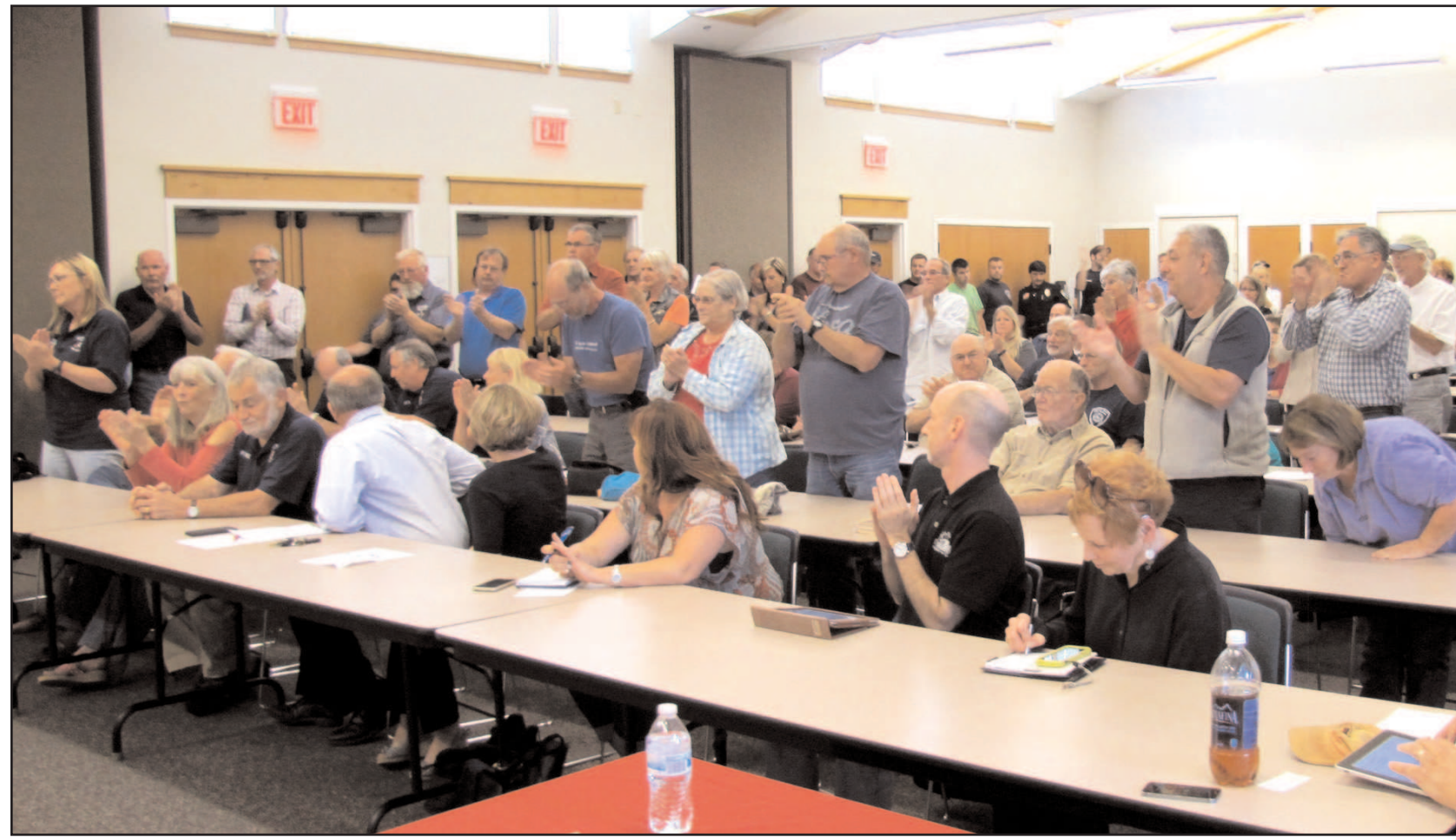
Community members applaud after a speaker addressed the fire board Tuesday night. More than 100 people attended the meeting.

Siuslaw fire board rescinds motion to dismiss Langborg