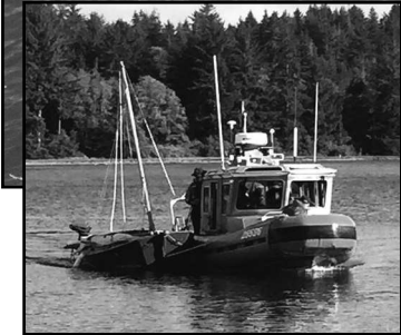
Siuslaw Valley Fire and Rescue and the U.S. Coast Guard send boats to help a capsized sailboat on the Siuslaw River Monday.

the boat operator in securing his boat and towing it back to shore.