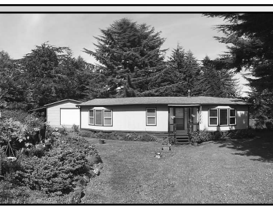
SPECTACULAR PARK-LIKE SETTING newer roof & plumbing. Lovingly cared for and landscaped by original owners. Two tax lots. A must see $299,500 #11036 MLS#15223051