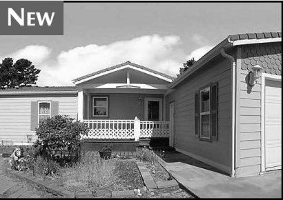
READY MADE APPEAL Cottage charm, cul-de-sac living in this 3 bedroom, 2 bath home in town, close to amenities and recreation. Fenced yard, great floor plan and newer roof and siding affordable find. $169,000 #1107

88454 4TH AVENUE JUST A SHORT WALK TO THE BEACH from this immaculate move in ready manufactured home. Enjoy the sound of the surf from your fully covered deck. Fully fenced yard with dog house and storage shed. Full RV hookup.Inside has plenty of light from solar tubes. $159,900 #11070 MLS#15501776