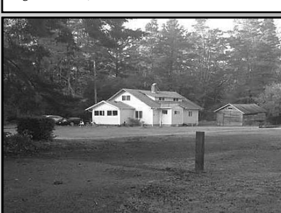
GREAT INVESTMENT PROPERTY Great rental property on 1.42 acres in Westlake. 1940's home with 3 bedrooms, 1 bath. Rental income is $850/month. $179,000 #10965 MLS#15066856