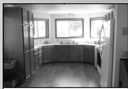
IN TOWN CHARMER Walk to Old Town from this clean 2 bedroom, 2 bath home. Beautiful new floors, bay window in kitchen, handicap walk-in shower stall, large deck & private yard. All appliances included. Double car garage & low maintenance yard. $189,000 #11057 MLS#15674135

2231 19TH STREET WELL CARED FOR HOME IN QUIET NEIGHBORHOOD. Wind protected city location with fenced backyard and tons of parking. Super clean 2 bedroom, 1 bath home. Move-in ready. Nice laminate flooring in master bedroom with slider to yard. Perfect starter home or retirement home. $158,000 #11051