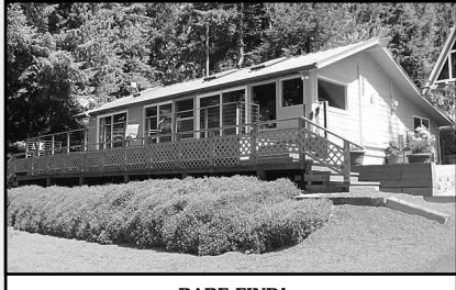
RARE FIND! Own a slice of Siltcoos! This recently refurbished bungs ow and bunk house with dock, located on one of the BEST fishing lakes in the Pacific Northwest is move-in ready. Just in time for summer fun as a get-away all alone or a gathering spot for family & friends $394,000 #11021 MLS#15551395