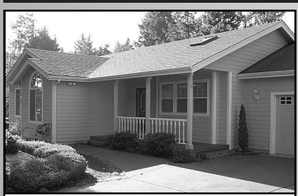
MUNSEL CREEK ESTATES One of Florence's favorite neighborhoods! 1 level 3 bedooms. 2 baths home in exceptional condition Hardwood floors throughout, granite counters, garden shed, landscaped yard. Priced to sell! $259,000 #10969 MLS#15657267