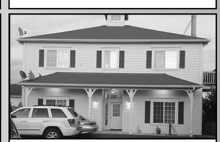
Charming apartment building in heart of Old Town. 4 deluxe apar ments with private deck/patio + small commercial office. 2 upstait units with river/harbor view & wood burning fireplace. All units ha washer/dryer, range & refrigerator, dishwasher & disposal, berb carpet & window blinds. Immaculately clean, meticulously mai tained. Fully unfed near zero upcancurate a treat long term tenant tained. Fully rented, near zero vacancy rate, great long Off street parking. $495,000 #10961 MLS#150205