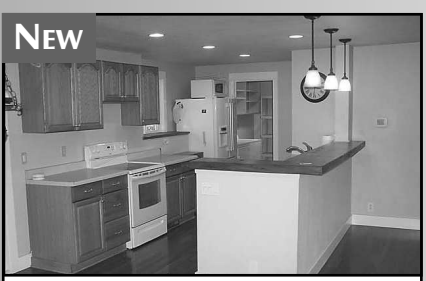
BEAUTIFULLY REMODELED THROUGHOUT vood laminate flooring. Decorator touches & colors, plus new kitchen design make this country home a great value Heat pump, 2 car garage with gated driveway & wood storage. Call today!! $155,000 #10765 MLS#15067317

condo has 2 bedrooms, 2 baths and a wood burning stove. Great views of the Bridge, river & dunes. This is a great Bay Bridge condo for a great price! $210,000 #10981 MLS#15119363