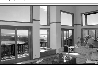
DRAMATIC OCEAN VIEWS Captivating home enveloped by Pacific Ocean views. Walk through the welcoming entry & be dazzled by an incredible view that can be part of memory-making times in this cathedral ceilinged home; allowing for boundless creativity in color & art. Generous storage & built-in amenities. $479,000 #11031 MLS#15369425