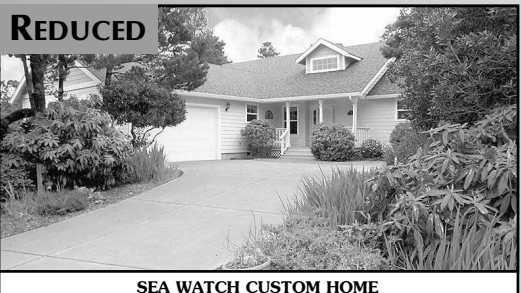
n quiet Sea Watch this custom home built with quality has had a profe

sional pre-inspection with completed repairs. This lovely 3 bedroom, 2 bath, 2+ garage welcomes you with a front covered porch and the back covered deck offers relaxation and the privacy of native landscaping. Motivated sellers encourage you to take a look! $295,000 #11024 MLS#15401551