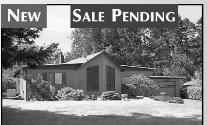
EXCEPTIONAL VALUE, ORIGINAL OWNER! great 0.54 acre lot with room for RV parking or shop, & garden space. Spacious floor plan, heat pump & full appliance package. Nothing like it for this price & condition. $184.500 #11059 MLS#15686130

Build your own dream house overlooking the beautifu Pacific Ocean. Elevated lot with new gravel driveway. A five minute walk to the beach. Great location. $250,000 #11058 MLS#15614252