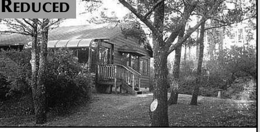
2+ acre parcel with single level 3 bedroom, 2 bath home. Sunroom plus

IF YOU'RE LOOKING FOR A PLACE out but not too far, this is it! Double-wide mfd home with extra bonus room. Located south of town with a re-purposed gas station bldg which is now a shop/barn for a horse. Just under an acre, near the end of the road. $227,000 #11045 MLS#15458570