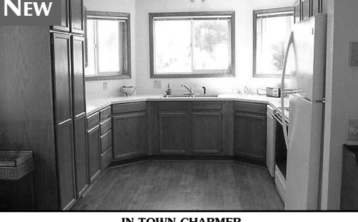
IN TOWN CHARMER

River, bridge & Old Town views from this solid income producer with redevelopment potential & high visibility. 5 apartments, home & 2 garage/shops totaling $41,100 annually. What an opportunity! Put your money to work for you. Invest in the future of Florence with this covet location by the bridge & river. $395,000 #11063 MLS#15249697