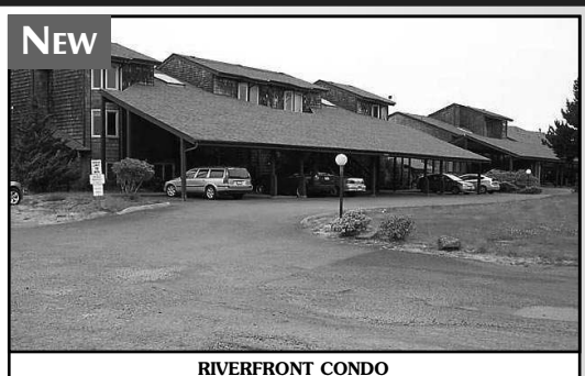
Everything stays: all furnishings, appliances - right down to the silverware A complete turn key. Includes 2 parking spaces and 2 storage units Beautiful Siuslaw River views. $225,000 #11056 MLS#15612427