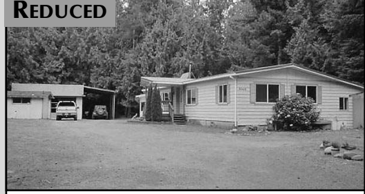
85416 ARMSTRONG WAY

2100+ SF 3 BD home only minutes from beach access. Large, bright & cheery kitchen w/upgraded appliances, island & wet bar opening to a very nice deck w/hot tub. Ideal for entertaining. Fenced landscaped, greenhouse, 2 car garage, carport plus room for additional parking. Comes with a home warranty. $219,000 #11062 MLS#15272841