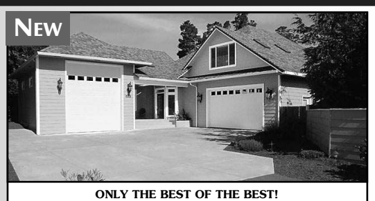
CUSTOM HOME with 3,705 square foot, 4 BR, 3.5 BA in Willow Dunes. 2 car garage plus RV garage with hook-up. Huge family/hobby/media room plus open floor plan living room, dining room and gourmet kitchen. Large guest suite bonus room! Master suite plus 2 guest rooms/den/office areas on main floor. New hardwood floors. Heated tile floor in master bath. Covered alcove front entry and lovely overed rear patio. $649,000 #11017 MLS#15276386

sional pre-inspection with completed repairs. This lovely 3 bedroom, 2 bath, 2+ garage welcomes you with a front covered porch and the back covered deck offers relaxation and the privacy of native landscaping. Motivated sellers encourage you to take a look! $295,000 #11024 MLS#15401551