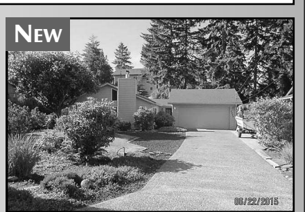
JUST REACH FOR YOUR PHONE and let's discuss this nice home near the end of a deadend street! Additional features includes family room and garage with extra oven/range combo and sink for processing fish or game! $224,900 #11061 MLS#15236627