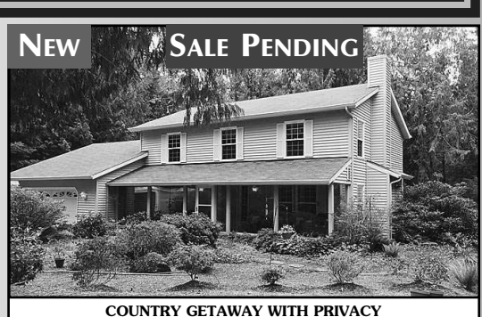
This large, 2 story house has it all. Room for everyone with 5 BR and 3 BA, 2577 SF. Well maintained, quaint glassed-in porch. Gardens & cedar enhance the country setting. $275,000 #11060