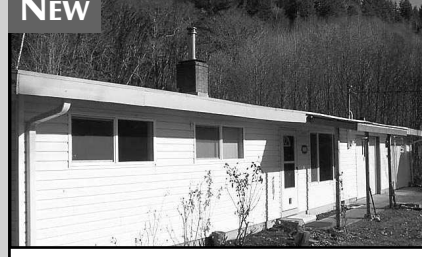
BEAUTIFULLY REMODELED THROUGHOUT

An exceptional custom 1788 SF, 3 bed, 2 bath hom extremely private. Located in Heceta South, this home has been carefully maintained & loved by the origina owner, and is priced to sell. $299,000 #10452 MLS#15532339