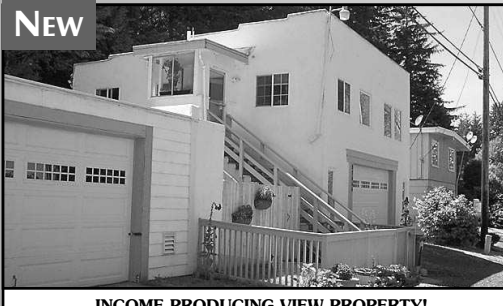
INCOME PRODUCING VIEW PROPERTY!

including cozy woodstove with stone & slate surrounds, & wood laminate flooring. Decorator touches & colors, plus new kitchen design make this country home a great value. Heat pump, 2 car garage with gated driveway & wood storage. Call today!! $155,000 #10765 storage. Call MLS#15067317