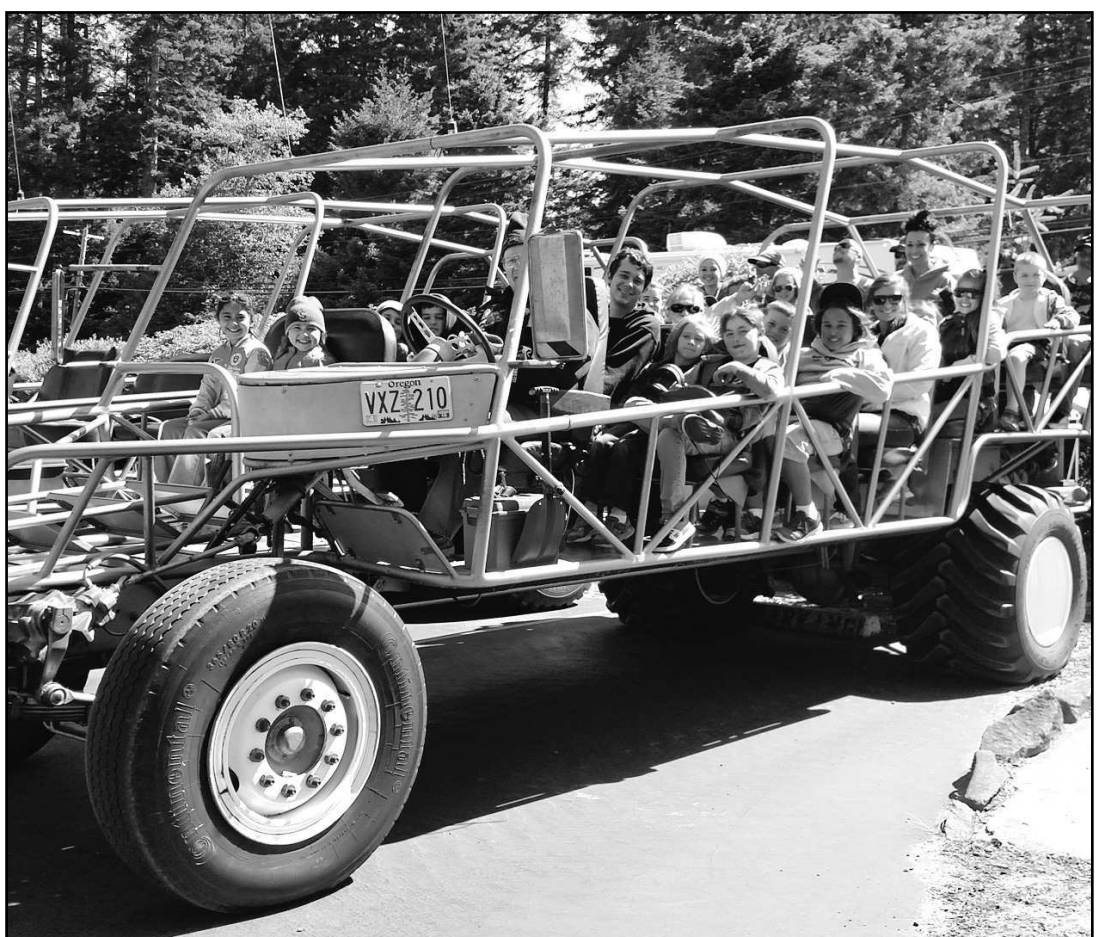
Sandland Adventures takes a group of Boys and Girls Club members on one of its giant dune buggies during the club's summer day camp.

Want Breaking News? More Photos? www.TheSiuslawNews.com