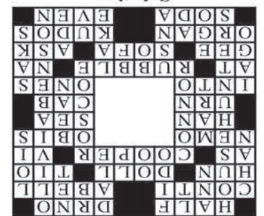
Solution Neil Patrick Harris