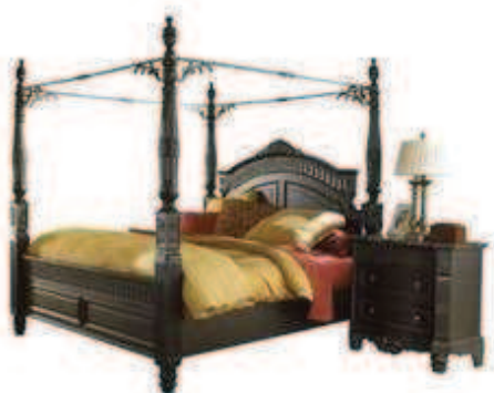
Bedroom Sets & Mattresses