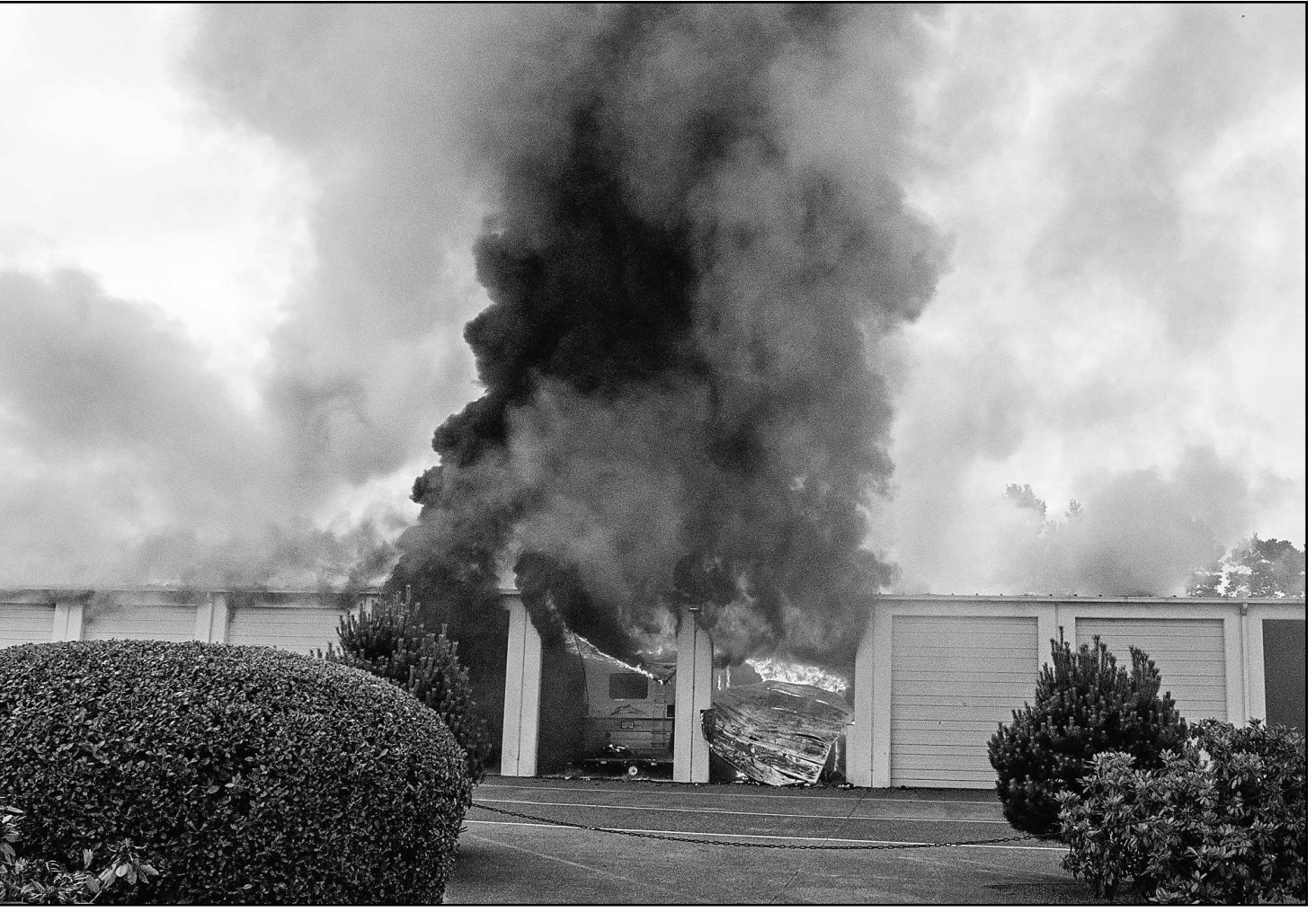
Smoke fills the sky after a fire destroyed about six storage units. The cause of the fire is still under investigation.