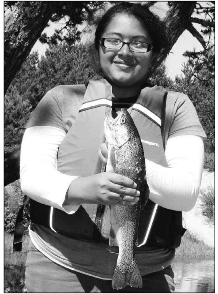
Students fishing in Cleawox Lake made quite the catch: the largest measured 17-1/2 inches.

The four-day day camp ran from Tuesday, June 2, to Friday,