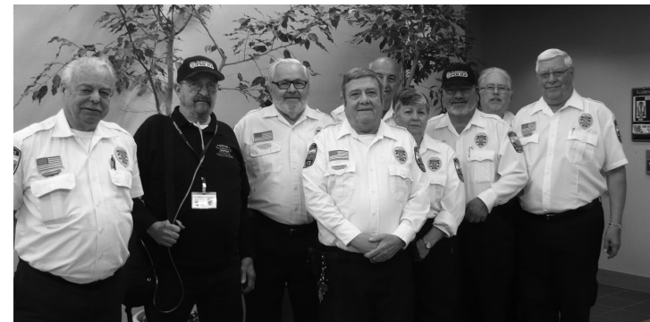
Florence Police Auxiliary Volunteers

J.D. ENTERPRISES ELECTRIC P.O. Box 31,000 • 541-997-6977 • CCB# 23013