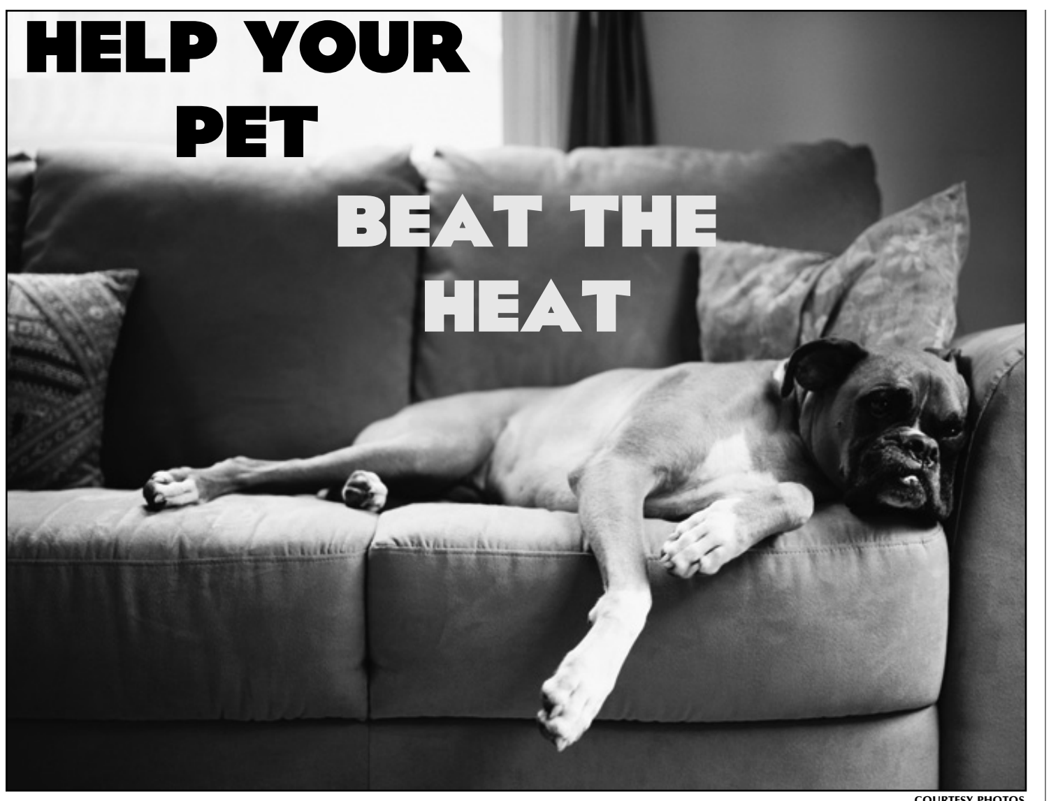
On hot days, which can be especially dangerous to animals, pets should be allowed to relax indoors with water.

xtreme heat can be unpleasant anyone, and pets are no exception. While it's easy for people to detect if their bodies are responding negatively to heat, those warning signs may not be so prevalent in pets, who may suffer in silence as the heat continues to rise.