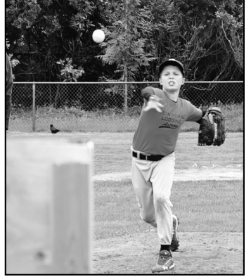
Young ballplayers were at Miller Park on Saturday, May 9, competing in the annual Pitch, Hit and Run event, which was held in conjunction with the Siuslaw Baseball Association's 100-inning game. Contestants threw at a target, hit from the tee and ran bases with measurements of accuracy in throwing, hitting distance and speed being recorded by volunteers. The top finishers will advance to regionals in June.

NOW BUYING USED CARS & TRUCKS Under 100,000 miles.