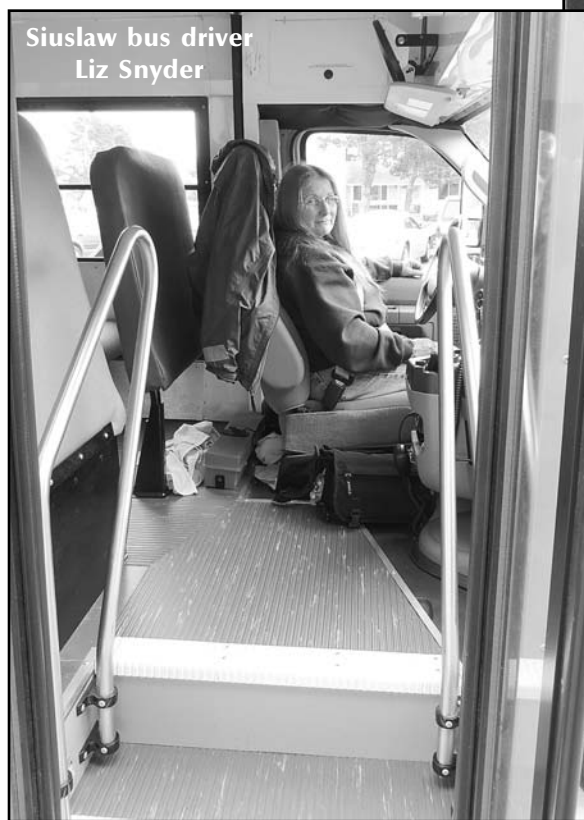
Siuslaw bus driver Liz Snyder