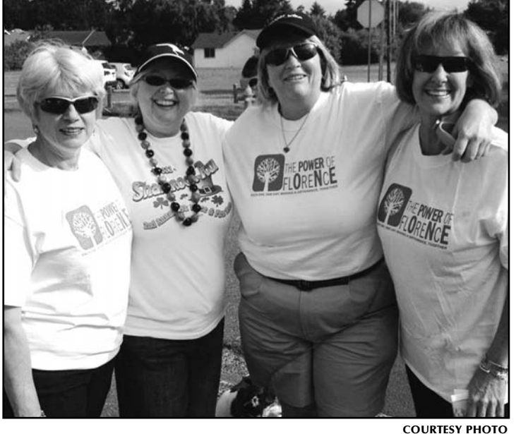
Volunteers gather during last year's Power of Florence

There are also service project events that beautify local parks, schools and beaches. In four years, there have been 130