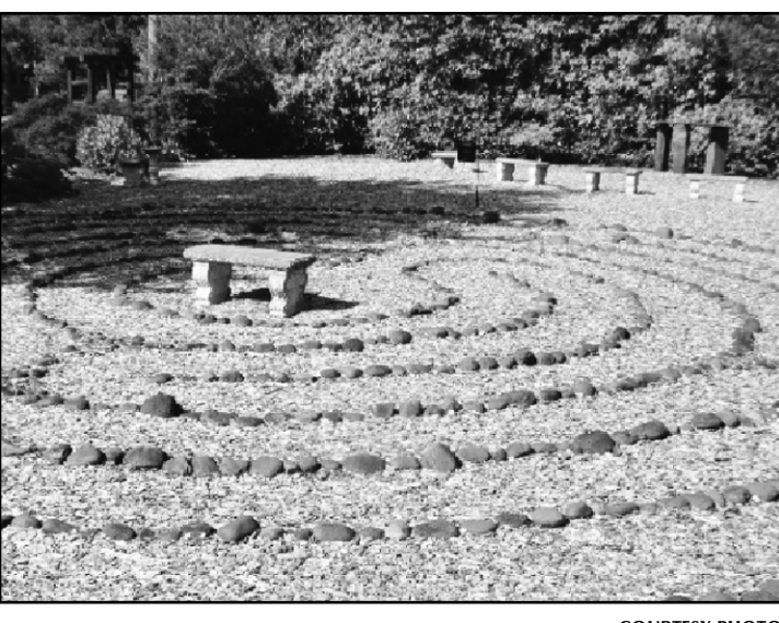
St. Andrew's Episcopal Church's Labyrinth Garden, will feature in Sunday's prayer service for the recent earthquake victims.

There are many organizations that are involved in the relief effort, but the church recommends the following agencies because of their Florence connections: Habitat for Humanity (the international program has a large presence in Nepal, and is already active in relief efforts there); Episcopal Relief and