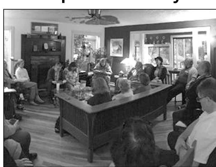
Soups On members discuss diverse spiritual topics weekly.

Everyone is invited to join Playhouse at First and Laurel a group with diverse spiritual backgrounds Monday, May 4, at 6:30 p.m., at 875 Seventh St.