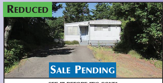
SEE IT BEFORE IT'S GONE! Affordable 3 bedroom, 2 bath in need of a little TLC to make it weekend getaway or full time residence. 10'x12' addition, 10'x11' enclosed porch. fruit troes 2 shade West Communications. enclosed porch, fruit trees, 2 sheds. Walk to clubhouse, pool, tennis courts, hot tub and more. You will own the land and home here. Good nome and floor plan for the price, come see it before it's gone. $52,250 #10875 MLS#14458097