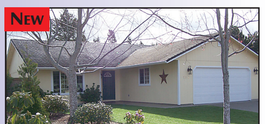
PICTURE PERFECT IN PARK VILLAGE An inviting beauty nestled in this in-town cul-de-sac. Impeccable curb appeal as you arrive to view this 3 bedroom, 2 bath home. 1460 sq. ft. of fresh & tasteful living in the open floor plan. Private & peaceful backyard with firepit, raised beds, beautiful landscaping & lawn, dog run, stor age shed & RV parking. Many custom upgrades. A piece of par in the middle of town! $239,500 #11011 MLS#15170544

Corner location close to schools and LCC. Double-door entry into living room with wood burning fireplace. French doors into sunroom. Kitchen with eat-in bar and separate dining area. 3 bedroom, 2 bath all on one level. Fenced yard with mature landscaping. $199,000 #11010 MLS#15659618