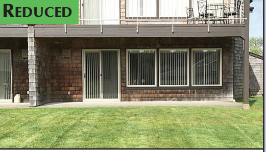
1080 BAY STREET #19

FABULOUS GROUND LEVEL CONDO at the west end of Bay Street This 1048 sq. ft. condo has 2 bedrooms, 2 baths and a wood burning stove. Great views of the Bridge, river & dunes. This is a great Bay Bridge condo for a great price! $233,000 #10981 MLS#15119363