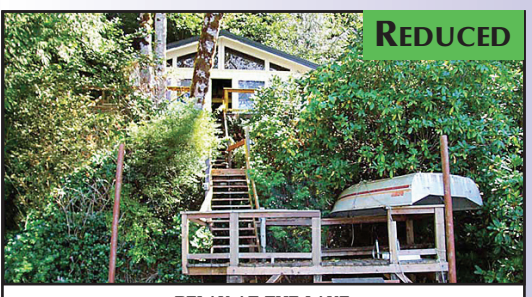
RELAX AT THE LAKE Cute cabin on Mercer Lake offers relaxation and much more! One bedroom with loft, one bath, deck and registered dock; everything needed to relax by the water! A cozy inside together with the beauty of nature offers both relaxation and recreation. Relaxation is waiting for you so visit this lovely lake property now! $229,000 #10844 MLS#14196921