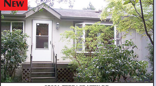
87831 TERRACE VIEW DR

Fresh, clean & ready. Current owner has completely remodeled this 3 bedroom, 1 bath home on a wood-fenced corner lot on quiet 20 \mathrm{th} Street. Remodeled to be his final home but plans changed and now he must sell. Cork floors, covered patio, fireplace, new roof, paint & interior details This is a solid, efficient home. $159,000 #11006