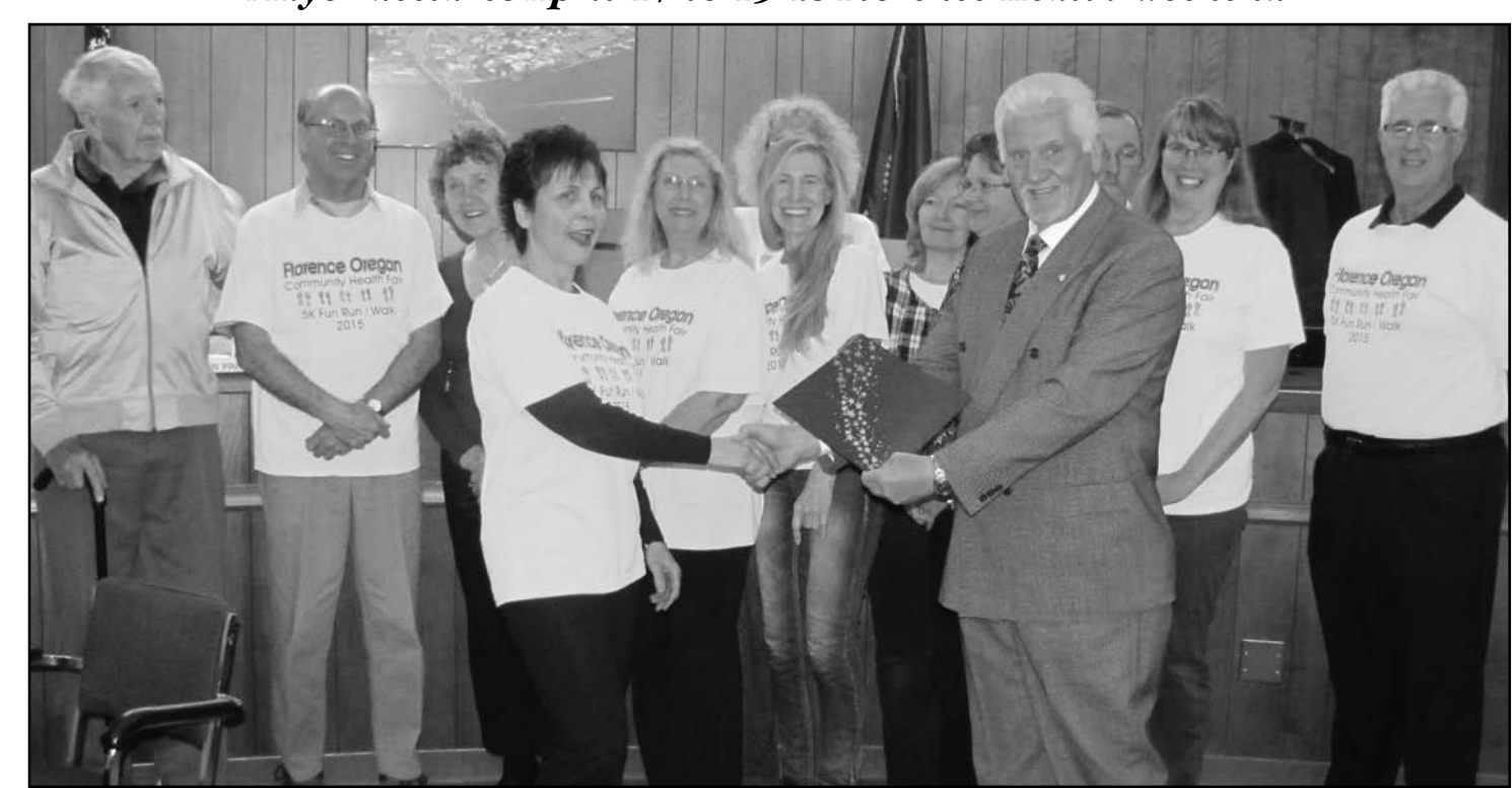
Volunteers from the fifth annual Community Health Fair accept a proclamation from Mayor Joe Henry at the Florence City Council meeting on April 6.

Mayor declares April 17 to 19 as Florence Health Weekend