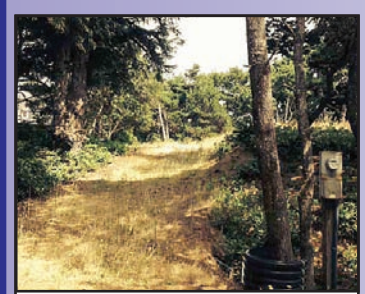
88219 1ST AVE All squared away & ready to go. 0.14 acre lot one block from beach. all utilities are in, even coves with 2-story cabin plans so you can get hat view of the ocean. $95,000 #10879 that view of the MLS#14673411