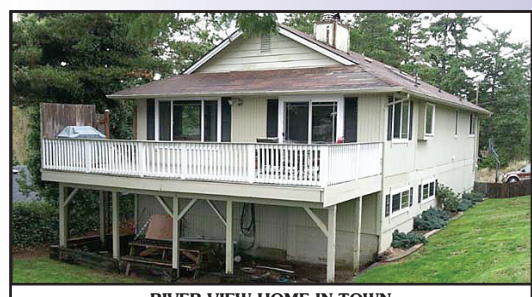
RIVER VIEW HOME IN-TOWN Great southern exposure. Spacious family home with large rooms & open spaces. Three bedrooms, 2 baths upstairs & additional living space downstairs. Double garage, fenced yard and deck overlooking the river Great place to watch the fireworks! $239,000 #10738

2345 18TH STREET Lots of possibilities for this 2132 square foot in-town home. Previously used as a nursing home, you could house a large family or have a child care facility. There are 6 bedrooms & 2 baths, one with a walk-in shower, the other with a Jacuzzi tub/shower. This property is very well maintained with a new roof, vinyl windows, newer siding & re-done backyard. You really must see this property to see how truly special it is $189,000 #10974 MLS#15236442