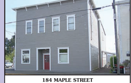
off-street parking. 4700 sq. ft., 2-story building with a fully equipped kitchen. Original fir floors. Three rest-rooms. Storage areas. Restored in 1991. New roof ir rooms. Storage areas. Restored in 1991. INEW 1001 III 2002. Repainted 2010. Multi-use. $339,900 #10822