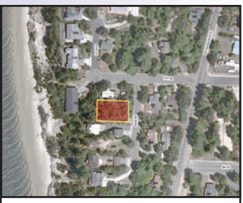
EXCELLENT NEIGHBORHOOD owner financing. 78' x 120' lot – wooded and private with nice homes all around. A great CC&R's. $50,000 #10518 MLS#12387105