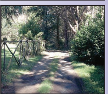
ALDER DRIVE most peaceful, secluded lots ju minutes from town. Over half an acre where ou could park your RV and develop later