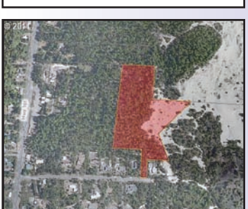
Where else can you find a 10+ acre lot close to town. Partially cleared. Septic approval. Backs up to Forest Service land with dunes access. Could be good horse property. $120,000 #10611 MLS#13637972