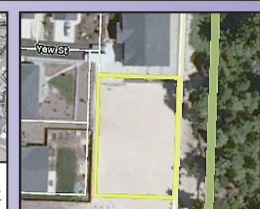
CORNER OF 12TH & ZEBRAWOOD acre lot in town. Cleared with underground util-$75,000 MLS#15580528