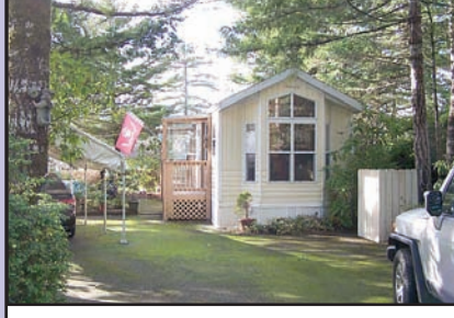
COAST VILLAGE FIND Lovely 1 bedroom, 1 bath Brekenridge MH. Beautiful sunny lot with plenty of gardening potential. Small hobby/gardening shed. Carport with ample space for more. A must see! $85,000 #10970 MLS#15676726