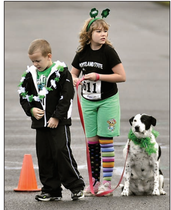
A bit o' the green is always welcome, no matter who is wearing it.