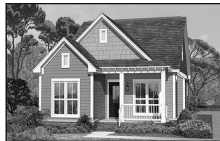
0613 Jensen Ln - Proposed cottage in the south lakes area with scenic lake views and customizable homeplans. 3 or 4 bd rms, 2 baths, 2001 sq. ft. Lot must be purchased before construction. Great lakefront neighborhood. $499,000. #2326-14236253