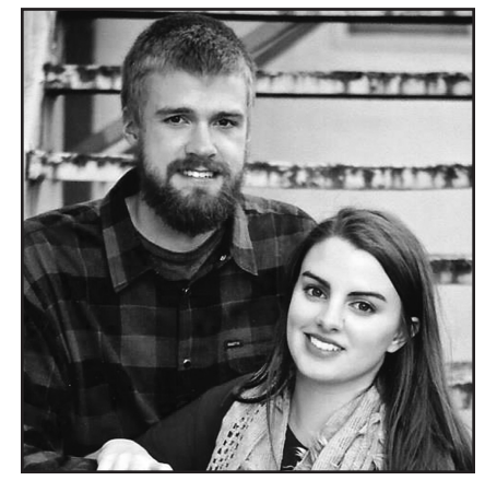
Her fiance graduated with a degree currently employed with the U.S.

in forest management, and is Forest Service in Waldport.