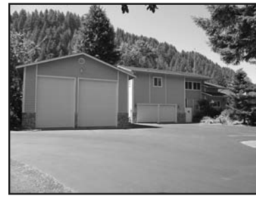
9202 Phey Ln - Enjoy Siuslaw Riverfront living in this 2963 sq. ft. custom home. This 3 bdrm, 3 bath home is located in a gated community for added security. Registered boat house, RV barn and 2-car garage on 1.17 acres. Extensive amenities list available. $689,000. #2249-13544935