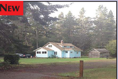
4655 PACIFIC AVE

pacious kitchen with skylight, ceiling fan, custom oak abinets and eating bar. Dining area with slider to the leck. Living room and master bedroom both with custom ceilings. Master bedroom with ceiling fan, mirrored closet doors and pocket door to the bathroom with shower. Yard is landscaped in the front & back and gated. Double car garage, plus extra parking. $165,000 #10853 MLS#14260166