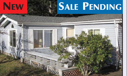
CLOSE IN COUNTRY LIVING!

Wide avenues, lush vegetation, beautiful home, large lots. Sound like a great place to build your dream home? This private, end of cul-de-sac location is in an exceptional gated community located within minutes of all con veniences. Just a short stroll to the esplanade and spectacular views overlooking the river, dunes and ocear beyond. $79,000 #10962 MLS#15658694