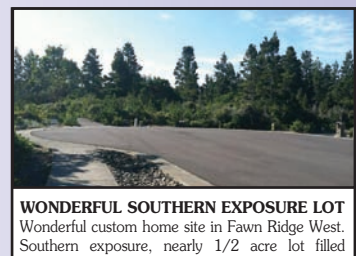
w/native vegetation. Level, usable lot, dense oliage & no neighbors to the south for privacy. OCEAN VIEW LOT Two stories allowed & potential ocean view from 2nd story. All underground utilities available. Fine custom homes all around. Build your dream house near the beach! $85,000 #10902

Beautiful riverfront / ocean view lot located in upscale neighborhood of fine homes. Shelter community in the heart of Florence. Protective covenants. Build your dream home with a fabulous view. 0.76 of an acre. $120,000 #10188 MLS#11631654