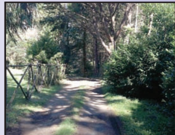
most peaceful, secluded lots jus minutes from town. Over half an acre where you could park your RV and develop later $55,000 #10798 MLS#14296334

"Woods on Woahink" - waterfront lots on Woahink Lake. Very private 1.24 acre wooded lot on end-of-road cul-de-sac. This is one of the very last building sites available on the lake. Build your dream home among the old growth trees. Swim, boat, or just watch the sunset from your own dock. $325,000 #9362 MLS#9058374