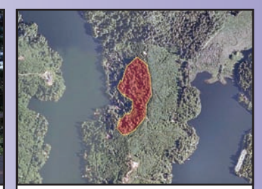
MERCER LAKE VIEW ACREAGE

Where else can you find a 10+ acre lot close to town. Partially cleared. Septic approval. Backs up to Forest Service land with dunes access. Could be good horse property $120,000 #10611 MLS#13637972