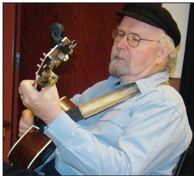
Winter Folk Festival's annual amateur pie contest and sale was a hit during last weekend's event, which also featured an artisan craft fair and a full lineup of performers, including headliner singer-songwriter Tom Paxton (above right), at the Florence Events Center.