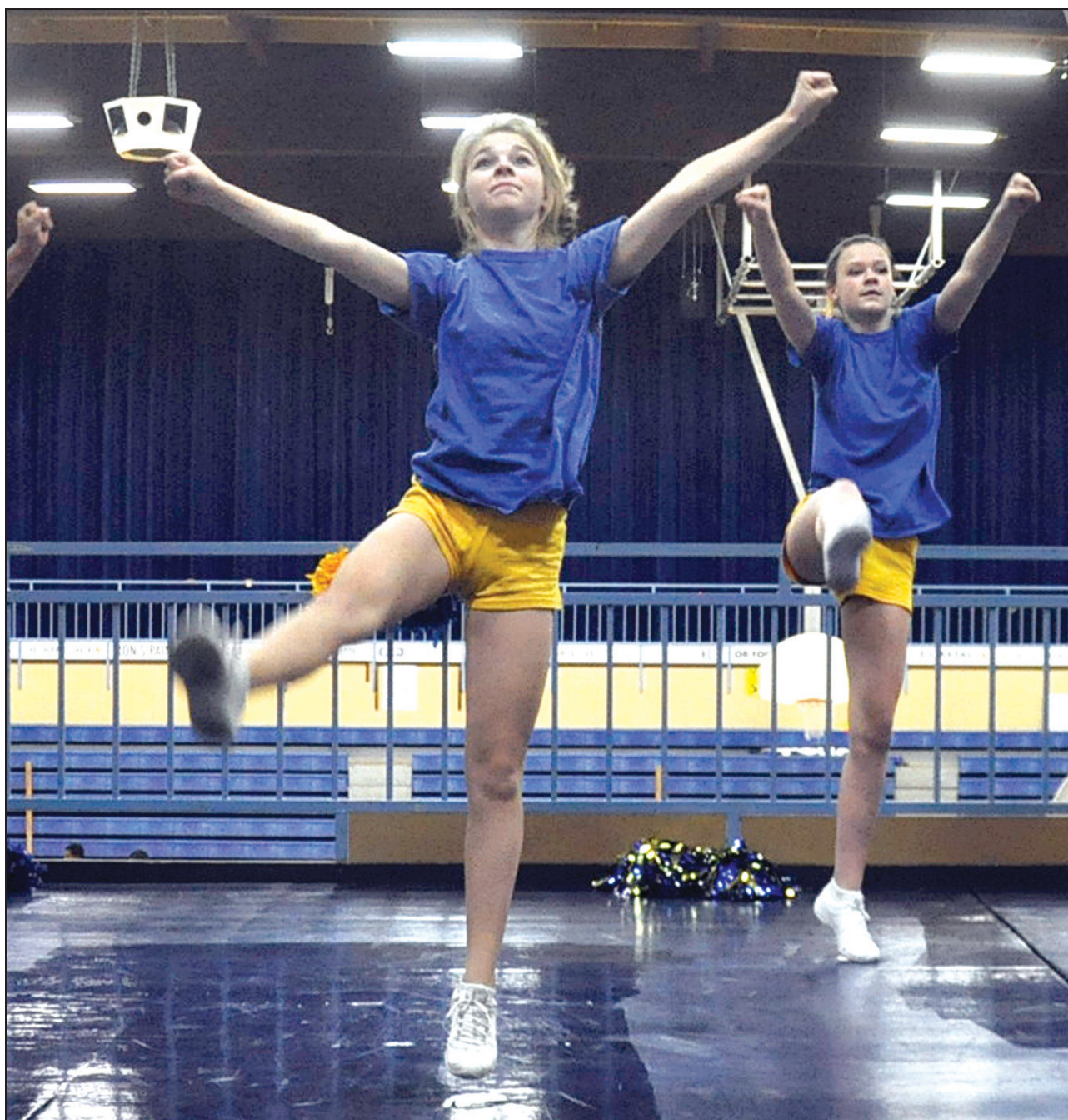
Members of the Viking cheerleading team warm up during preseason practices in November.