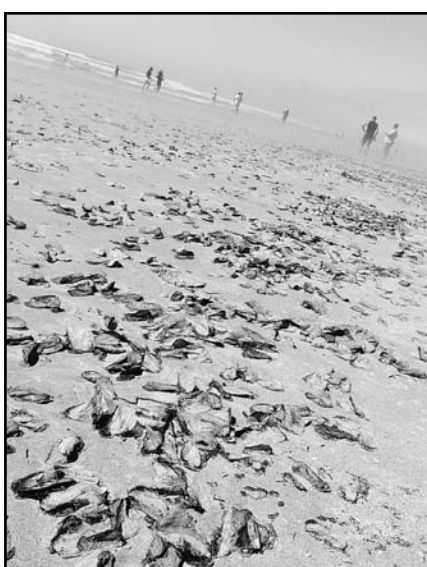
Veella veella, a distant relative of the jellyfish, washed to shore by the thousands in July, including on Heceta Beach in Florence.

A letter dated Dec. 14, 1774, owned by a Florence resident, reveals the long-lost message that Revolutionary patriot Paul Revere delivered from Boston to Portsmouth that led to attacks on the colony's arsenal, Fort William