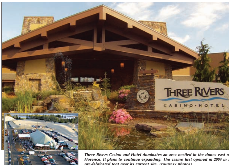
Three Rivers Casino and Hotel dominates an area nestled in the dunes east of Florence. It plans to continue expanding. The casino first opened in 2004 in a pre-fabricated tent near its current site.