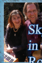
Sky in the Road