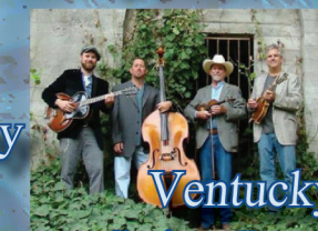
Kentucky String Band