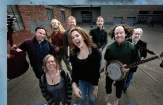
The Sugar Beets