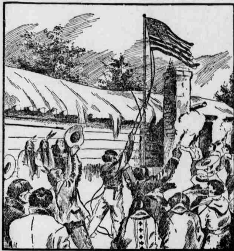
RAISING THE FLAG ON OLD FORT HALL.