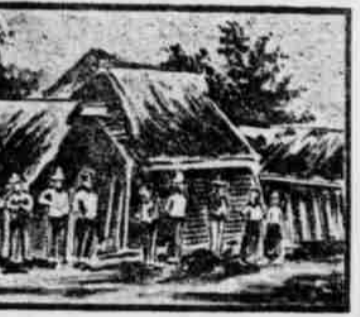
A TYPICAL HAT MAKERS' HUT.

North American Craze for Hats Keeps South America Busy. The Panama hat craze is probably the most expensive fashion ever adopted by men. Lyman J. Gage is said to have paid $500 for a hat—enough to pay for a trip to Europe or to keep a young man in college a whole year. King Edward gave up $400 for his, and Jean de Reszke reached the top notch—he paid $600. These figures are of course away above the average, but no Panama worth wearing can be had for less than $25. If you aim to have a hat that may be tucked away in a vest pocket like a lead pencil or slipped through a finger ring you must be in the coupon-clipping class. Nevertheless, in spite of these figures, Panama hats are being sent from South America in ship loads, and about half the population of Ecuador and hundreds of persons in other South American countries are engaged in supplying hat luxuries for the men of Yankeeedom.