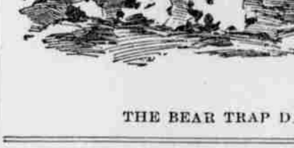
THE BEAR TRAP DAM AT LOCKPORT.

THE work is yet being carried on unceasingly, the widening of the Chicago River being now in progress.