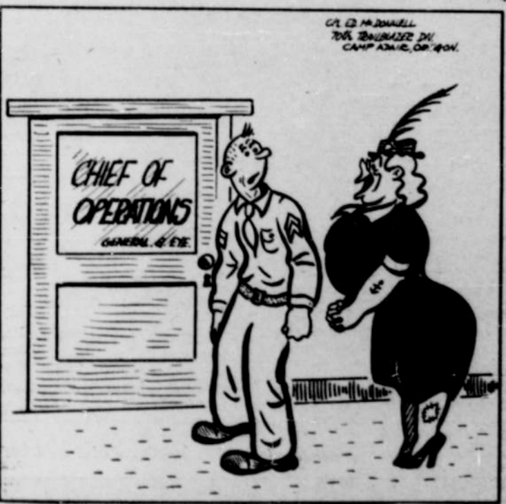
"I simply must tell him about mine!"