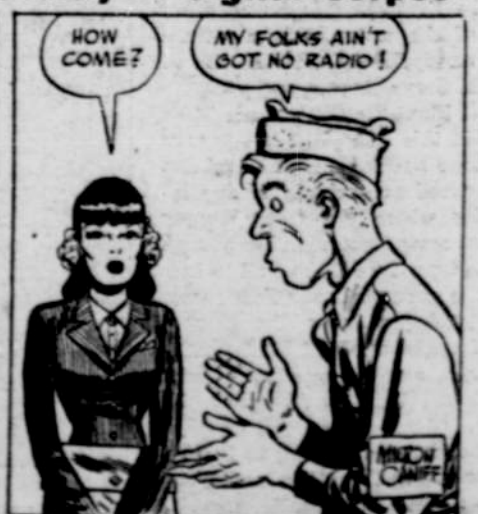
the Pirates." gained recognition in military circles for his "undeclared" war with the... was still at peace with Japan). The strip and "The Wolf" are... Aliations.