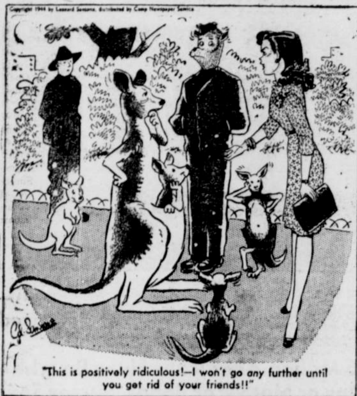
"This is positively ridiculous!—I won't go any further until you get rid of your friends!!"