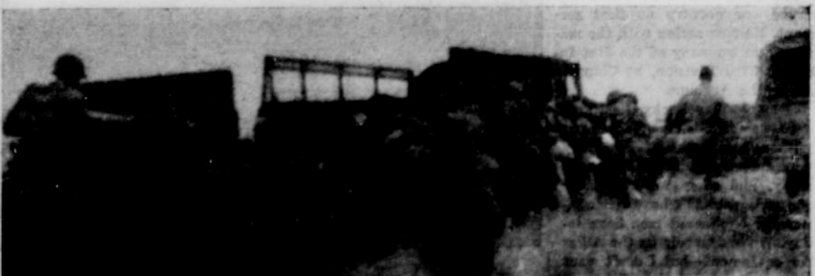
MEN OF THE 348th FA Bn. sweat and strain as they are forced by old man mud to push their prime movers and 155-mm. howitzers through spots on the range where ever their powerful machines let them down.