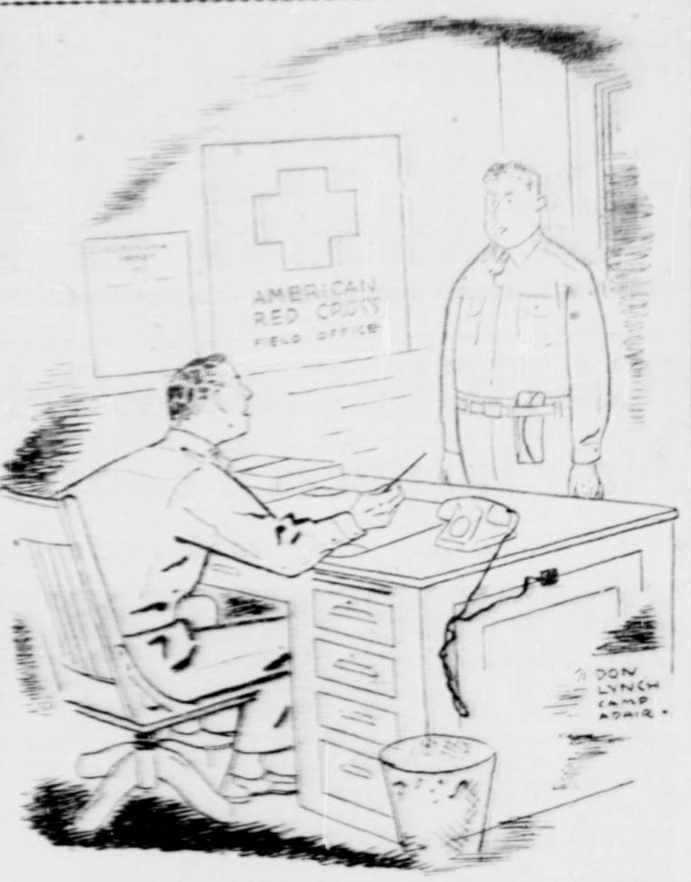
"No. Beagle! The Red Cross will not "toss you" for the furlough money."