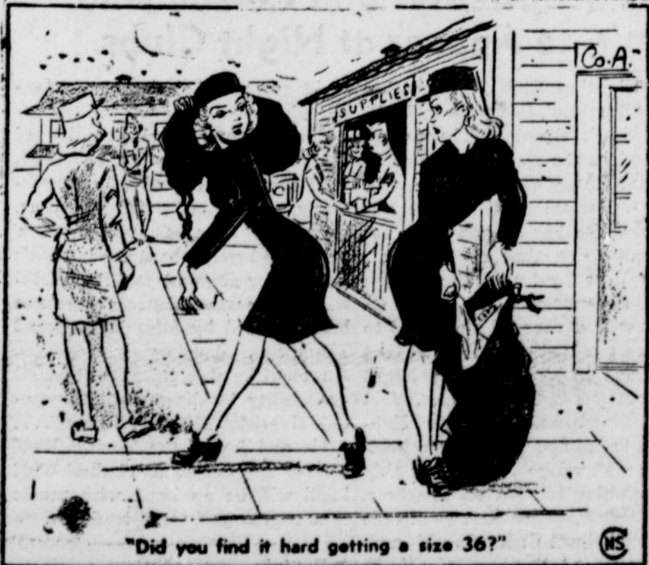
"Did you find it hard getting a size 36?"