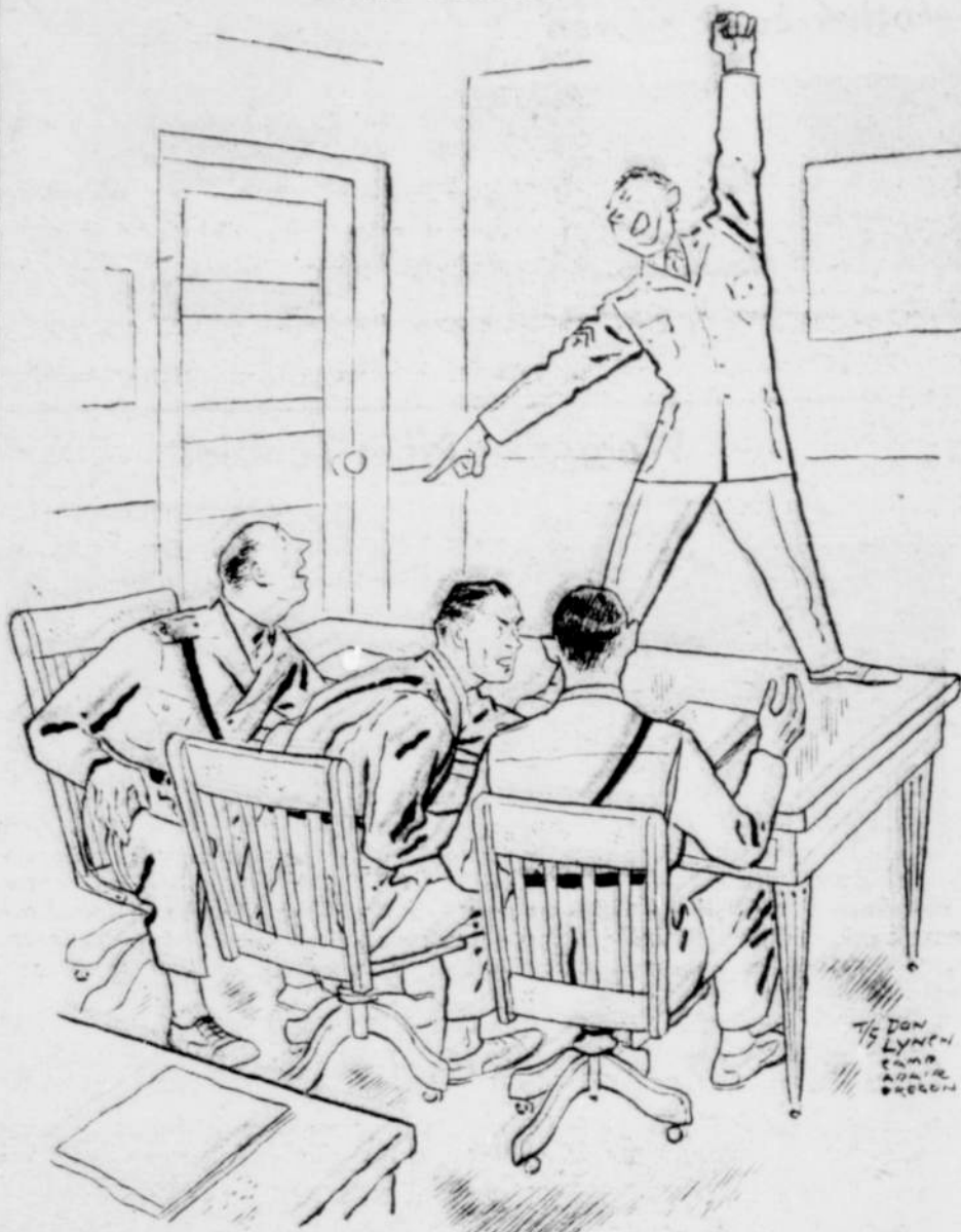
"I thought we agreed not to ask these fellows about their politics."