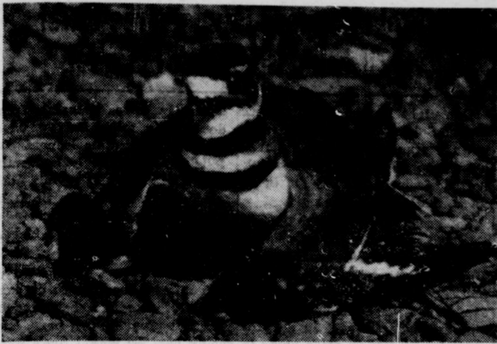
The perfect example of camouflage has been discovered just outside the gates of Camp Adair—it's the kildeer's "nest" which isn't a nest. Here we see mother kildeer, who is herself a tricky little thing, and the perfectly camouflaged nest of eggs.