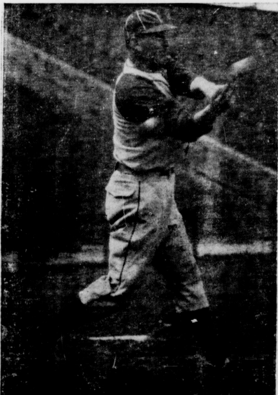
It was his mighty clout in the seventh which put the Timber Wolf game with University of Oregon on the ice and there are plenty of hopes laid in the bat and first base kind of game the ex-big leaguer dishes out, to help the 'wolves win Sunday's game at Eugene against All-Stars of the Cascade League.