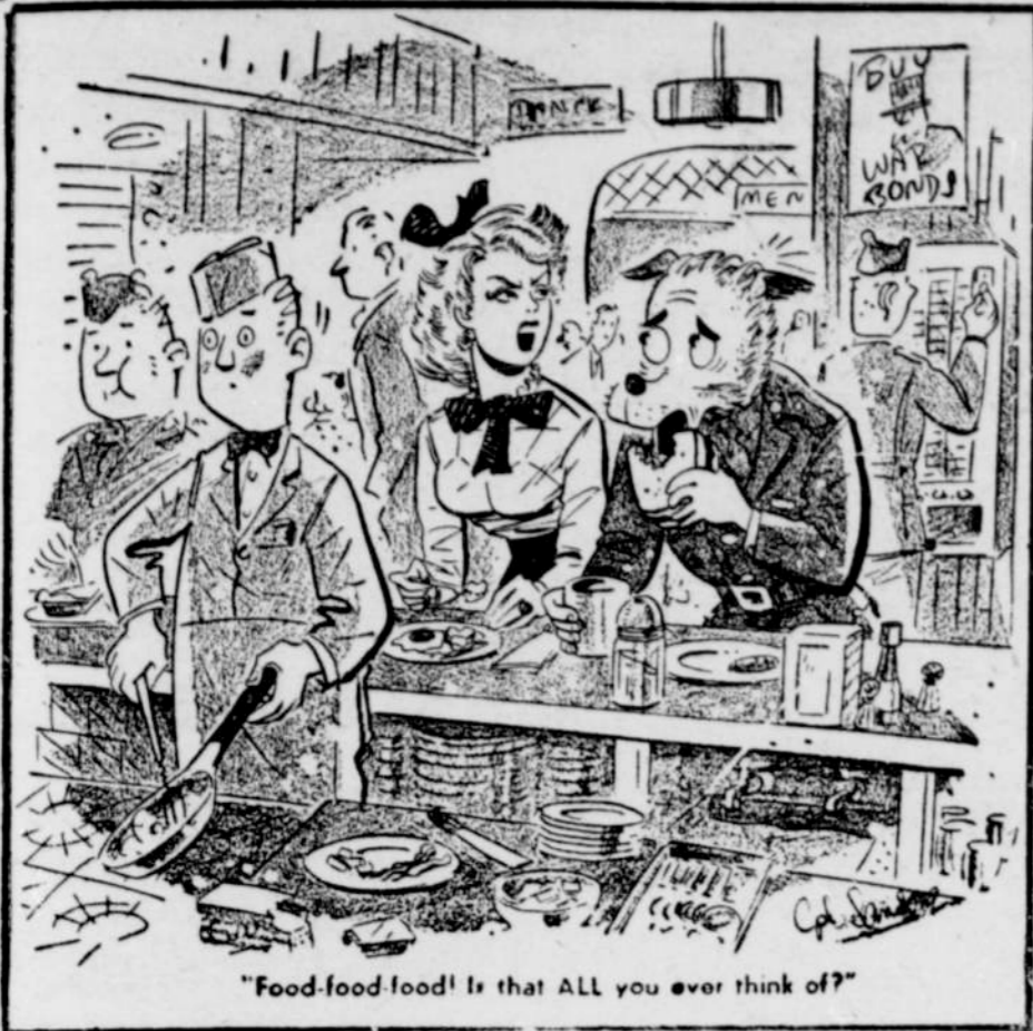
"Food-food food! Is that ALL you ever think of?"