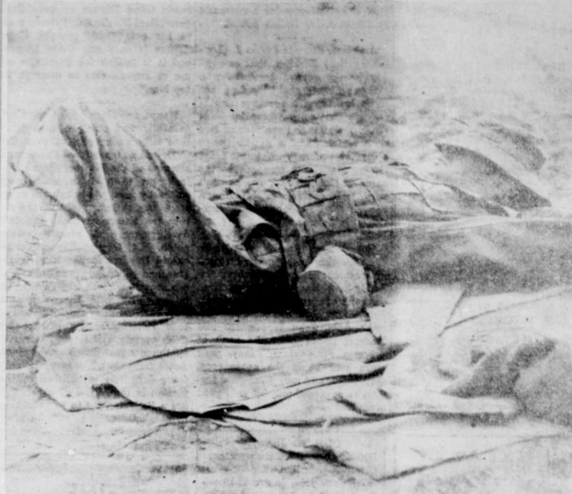
MANY A BARITONE has sung about a 'home on the range,' but the home he had in mind was not on the rifle range. But between shots, the soldier has time (sometimes) for a little relaxation, as this picture amply proves. A few moments of rest like this often result in a better score when the rifleman returns to the line.