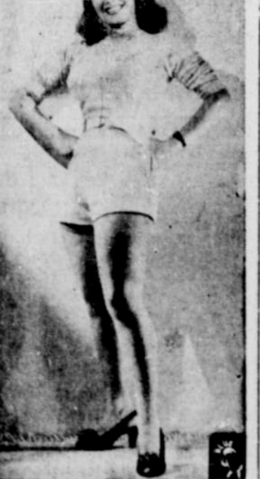
Next to singing and entertaining Uncle Sam's service men, BLUE network star Dinah Shore loves sports of all kinds. She is particularly fond of swimming, horserback riding and tennis.

American exports of sugar, wheat, and cereals, although only one per cent of total United States supply, have been particularly important to Russia, which has lost most of its sugar-beet and most of its richest wheat-producing areas to the Nazi invaders.