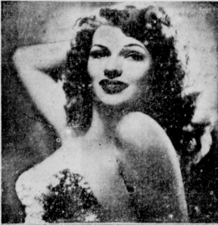
There is no reason in the world for us to run this picture of Rita Hayworth except that we follow the policy of running pictures of pretty girls whenever the censor isn't looking.