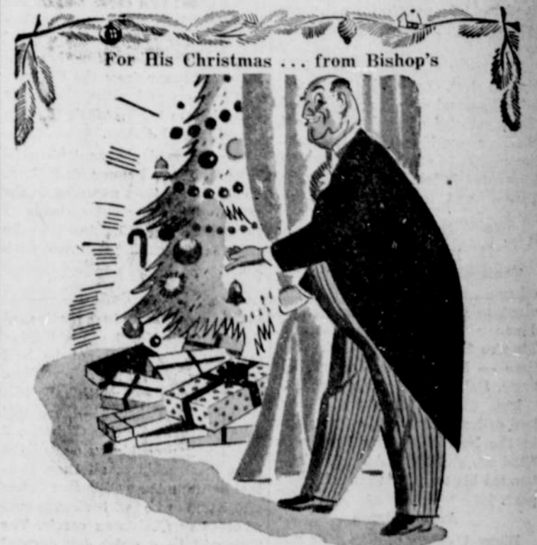
For His Christmas . . . from Bishop's

520 State Street Salem Ground Floor Locations 991 Willamette Eugene