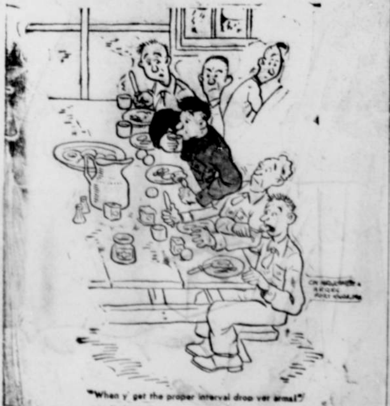
"When you get the proper interval drop your stress!"