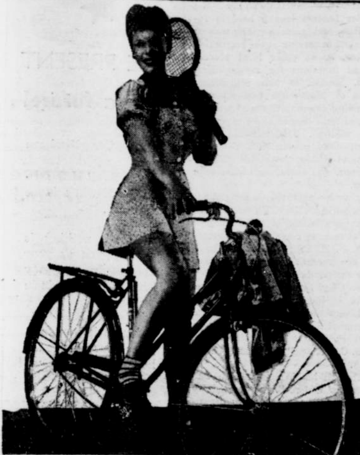
JOAN EDWARDS, singing star of "Your Hit Parade" on Saturday nights over the CBS coast-to-coast network and niece of famous star-maker Gus Edwards, has become the sweetheart of the ration boards, by selecting this outfit for summer relaxation. Corticelli anklets take the place of hose so that extra Nylon and silk can be turned over to the Army for parachutes. Her playsuit, which she has named the Nadocky after one of her most successful songs, cuts down on dress materials so that manufacturers can turn their efforts more to war efforts. The bicycle is her answer to rubber and gas shortages. "Harold Ickes will never call me a 'sabotourist,'" she explains.