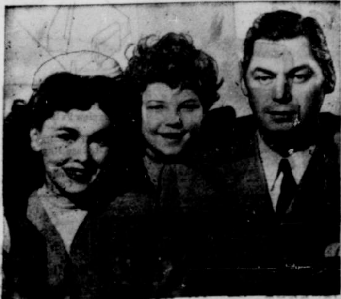
Maureen O'Sullivan, John Sheffield and Johnny Weissmuller leave the jungle to invade the big city in "Tarzan's New York Adventure," now playing at the Whiteside theater.